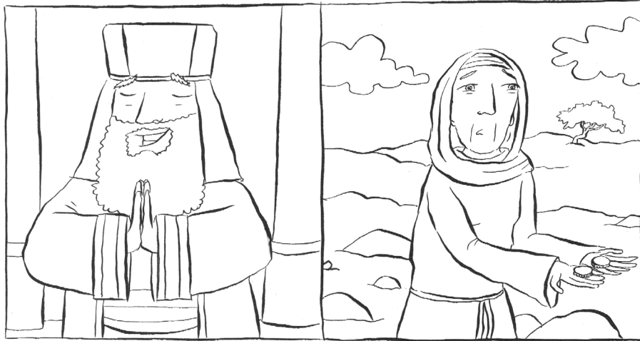
The scribe and the widow gave in different ways.

Jesus challenges people to consider what true generosity is.