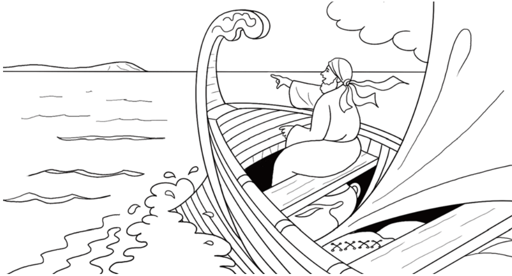
Paul sails to Macedonia.

Paul has a vision about travelling to Macedonia. He meets Lydia, who is baptized and becomes a follower of Jesus.