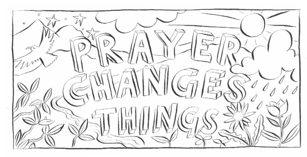
When you've coloured in this doodle, put it up at home to remind you to keep on praying.

Jesus tells a story to encourage us to keep asking God for what we need.